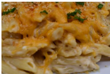
SIX CHEESE PENNE BAKE