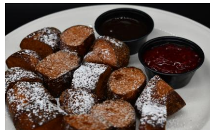
SOFT PRETZEL BITES