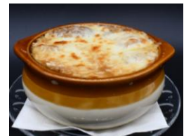
FRENCH ONION SOUP

All sandwiches served with French Fries and a Pickle Spear Upgrade to Mac & Cheese or Truffle Fries $2.00 Upgrade to Beer Battered Onion Rings $3.00