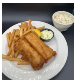
BEER BATTERED FISH AND CHIPS