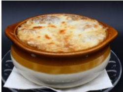
FRENCH ONION SOUP