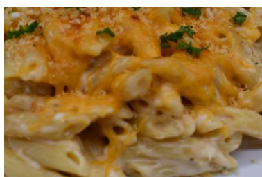
SIX CHEESE PENNE BAKE