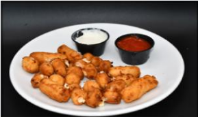
WISCONSIN CHEESE CURDS